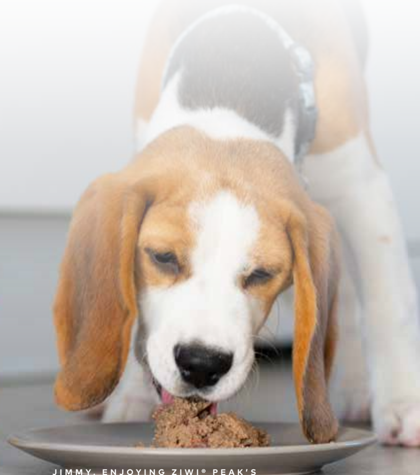
JIMMY, ENJOYING ZIWI® PEAK'S FREE-RANGE CHICKEN RECIPE